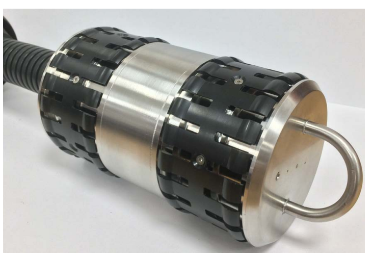
Figure 2: Probe Head