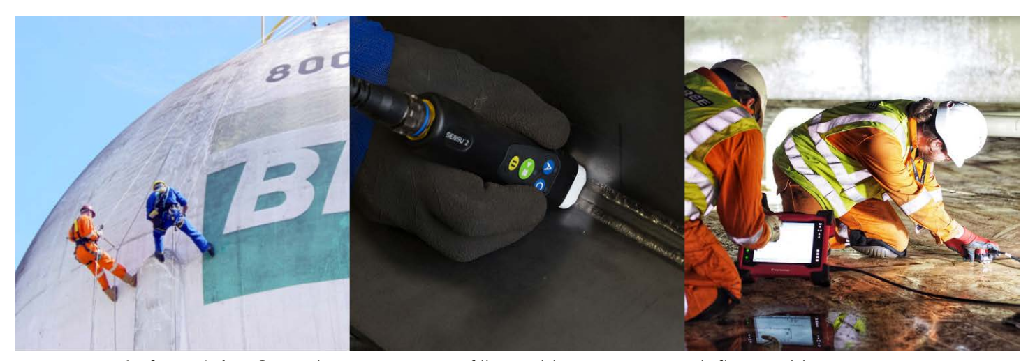
Left to right: Gas sphere inspection, fillet weld inspection, tank floor weld inspection

With these cost efficiencies comes higher productivity coupled with high Probability of Detection, or PoD. For reference, a 152-meter (600-foot) weld on a painted structure takes six days with magnetic particle inspection versus one and a half days with alternating current field measurement. New array probe technology offers a minimum of five times faster inspections compared to previous ACFM probes, also minimizing operator fatigue. The high-speed probe is ideal for tank floor and shell joints. At the end of the inspection campaign, a comprehensive report detailing auditable crack length and depth information is created which enables a proactive risk management program.