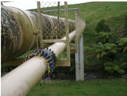
FOCUS+ used to inspect condensate line in New Plymouth, New Zealand

Eddyfi Technologies inspected and assessed the integrity of the aerial river crossings of the 20.3 cm (8 in) condensate line of a New Zealand customer.