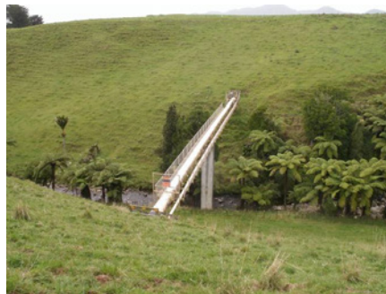
Location photo of a typical aerial river crossing inspected with FOCUS+

The widest of the aerial river crossings inspected was 65 m (213.3 ft) long after which the line entered a buried section. The FOCUS+ five-ring torsional tool was used in this particular case and the results show that the crossing was completely inspected and an additional 20–25 m (65.6–82.0 ft) of the buried and wrapped section.