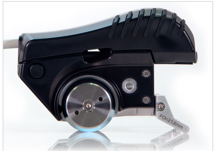
Figure 1: NDT PaintBrush pipe corrosion mapping scanner.

Corrosion is easily identifiable with UltraVision 3D; get 3D plotting for outstanding rendering of corrosion data on specimen parts. The tool can specify the depth of the corrosion. Therefore, you know when action must be taken. This requires UltraVision 3D license on an external computer.