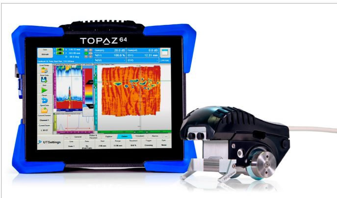
Figure 1: NDT PaintBrush coupled with TOPAZ64 ultrasonic instrument.

NDT PaintBrush is easy to use and requires minimum training while incorporating advanced high-performance technology. Don't miss anything and rest assured that the inspection is properly performed.